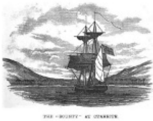
THE "BOUNTY" AT OYAKOUBA