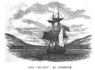
THE "BOUNTY" AT OAHU